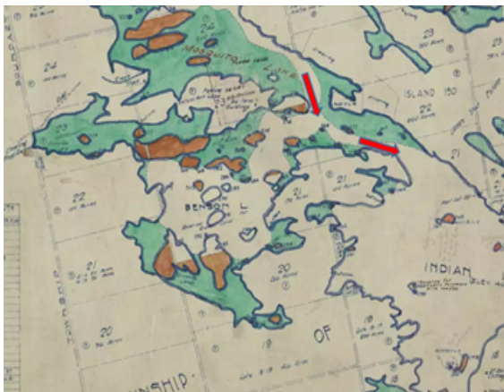
Figure 1. Benson Lake drainage pattern marked by red arrows. Part of Plan of Newboro, Clear and Indian Lakes in the Townships of Crosby South and Crosby North, 1925.

Benson Lake, located within the Cataraqui River watershed, is part of the Rideau Canal waterway. It drains through Mosquito Lake into Indian Lake. Part of the Township of Rideau Lakes, Benson Lake has a maximum depth of 12 metres and a shore length of almost 25 kilometres.