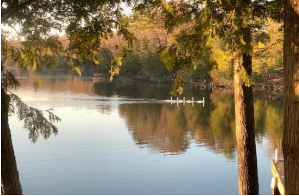
Figure 5. Like ships of the line, this group of five swans glides past an island on Benson Lake.

More recent arrivals are the honking Canada geese and the trumpeter swans whose bugle-like calls resound across the lake.