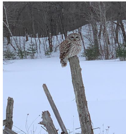
Figure 4. Barred owl in the winter waterfront on Benson Lake.

Being in Benson Lake is like living in a national park where you will be treated to the many different calls of the loons including yodels, wailing and their haunting laughter. You will also enjoy the melodious ascending whistle of the ospreys, Great Blue Herons, hummingbirds and Barred Owls who call "who cooks for you, who cooks for you all".