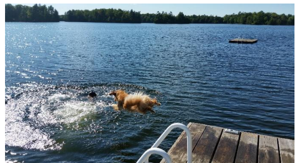
Figure 7. Golden retriever dives off a dock in Benson Lake.

Keep your eyes open for children and dogs jumping in off the end of docks.