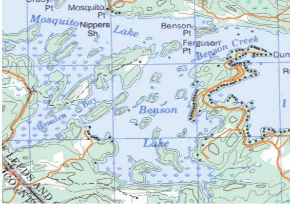
Figure 3. Extract from the 1994 National Topographic System map shows a cluster of buildings in the southwest bay of Benson Lake and full development of the Two Doctors project along Indian Lake Road to the northeast.