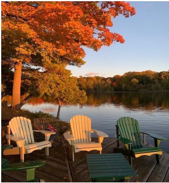
Figure 8. Benson Lake at sunset.

With a mix of seasonal cottagers and year-round residents, community members come together often for many wonderful events, from fish fries and sporting events, to community potlucks and cocktail hours on the dock.