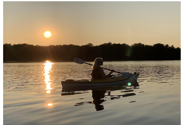
Figure 6. Kayaking at sunset on Benson Lake.

On any given summer day on Benson Lake, you will see people of all ages swimming, canoeing, kayaking, paddle boarding, boating, water-skiing and on occasion, sailing.